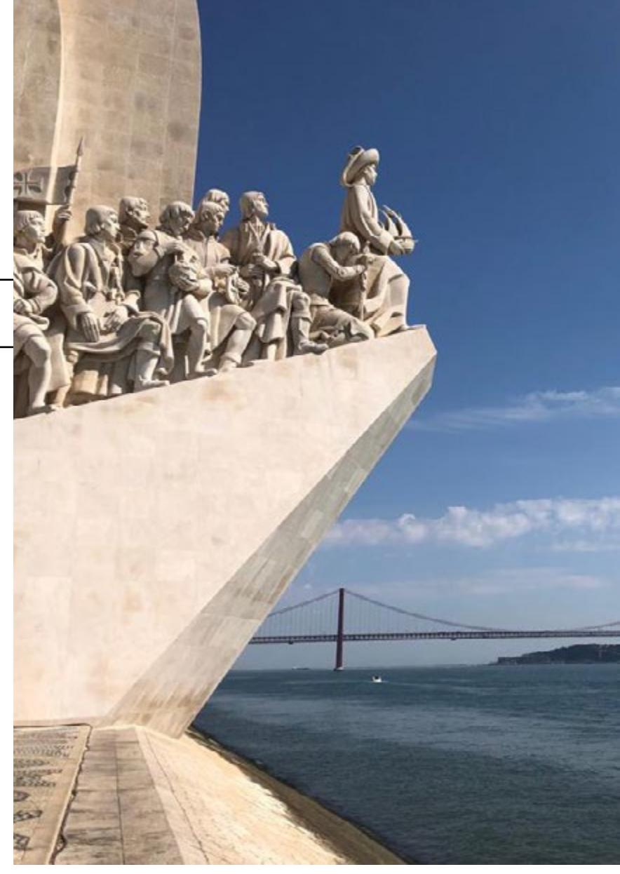
Monument to the Discoveries | Lisbon

On top of that, Lisbon, the economic center of Portugal, has established itself as the new location of the digital world and has been the location of the biggest internet technology conference worldwide, the so-called "Web Summit", since 2016.